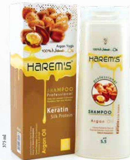
Product Code: 6216

The miracle of Fas, also known as the golden oil, is one of the richest oils in terms of vitamin E. Contains vitamin E as well as antioxidant components such as Omega-9, Omega-6, tocopherol, sterols and polyphenols. In our formula that makes nature meet science, we use natural based raw material, the hair and scalp while providing precise and in-depth cleaning, while argan oil and special vegetable oil blends helps regulating the moisture-oil balance, development of the process of the skin metabolism, moisturising the hair and protecting from the damages of free radicals. Keratin content gives elasticity to the hair and helps to reduce split end formation.