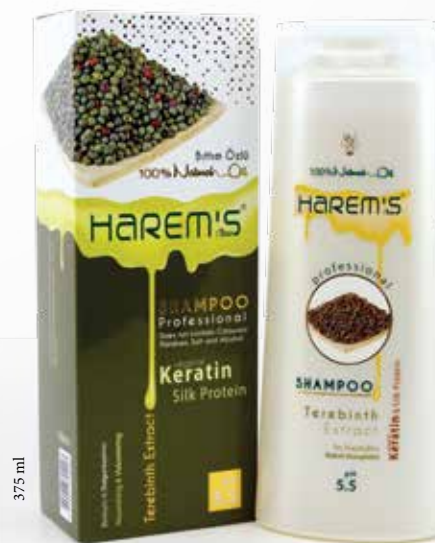
Product Code: 6247

Terebinth oil is rich in vitamins, minerals, antioxidants, herbal waxes, etheric oils, triterpenopsin, caratinoids, polysaccharides and fatty acids. In our formula that makes nature meet science, we use natural based raw materials that ensure in-depth cleaning of hair and scalp while special vegetable oil blends and bittum oil extract nurtures the scalp and the hair, supports the skin to protect the natural moisture-oil balance, helps the hair gain volume and strength. Keratin content gives elasticity to the hair and helps to reduce split end formation.